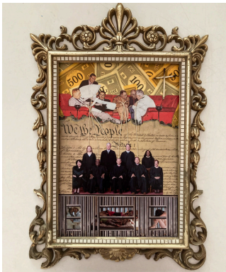
Erosion – G. E. Vogt

Together, these perspectives reveal a simple truth: art doesn't just reflect democracy—it actively protects it. Through imagination, critique, and human connection, artists help keep the democratic spirit alive when it is most at risk.